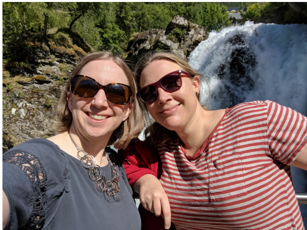
Figure 1: A picture, supposedly of the two personas of the subject in one place. Due to the results of this paper, we assume that this picture has been digitally altered.

In our investigations, we have discovered that she uses a different accent for each persona, one American and one Australian. Even when both of her personas are supposedly attending the same conference, many fellow researchers can see through this and just speak to her as if both