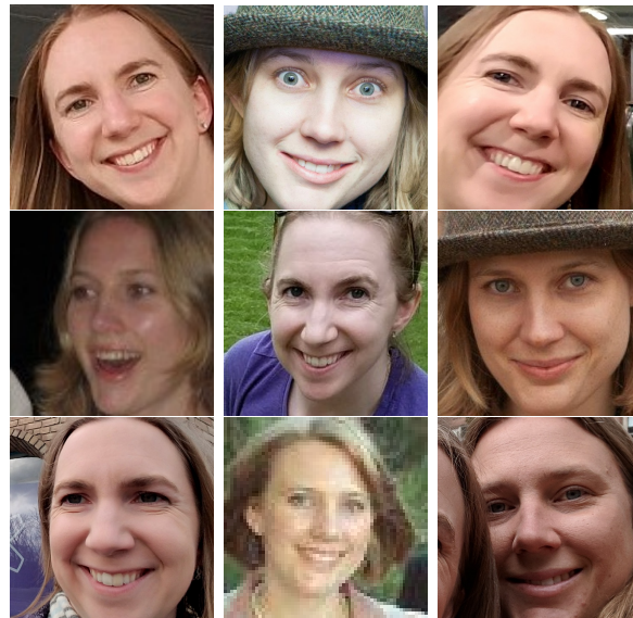
Figure 3: Examples from the data set. Can you tell the difference? We didn’t think so.